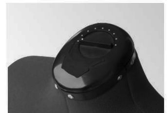
Size S/M Pinnable Neck

You can add padding to accommodate certain body features such as a curved back, high hip or protruding abdomen. You can accomplish this by filling the area with a pad then securing it with pins or double-sided tape.