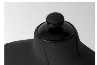
Size P/L Pinnable Neck

Two types of Pin Holders are present on the The DressFitter Dressform. Please view the location of each type here. (Size S/M) (Size P/L)