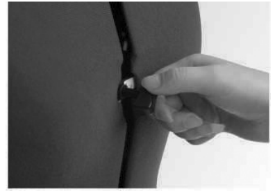
Adjustment Knob Tool

WAIST – 2 adjustment stations are provided at the waist area for adjustment. Gradually adjust the waist wheels in conjunction with the bust and hips adjustments for best results.